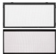
Straight or Curved Safety Barrier