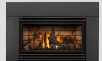
Deluxe Flashing Kit available in 6" and 9"