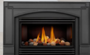
Arched Cast Iron Surround