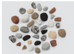
Mineral Rock media kit