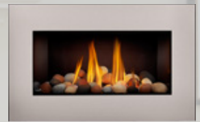
Brushed Nickel Faceplate