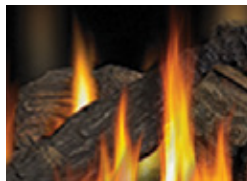
Decorative Porcelain Reflective Radiant Panels