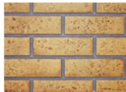
Decorative Sandstone Panels