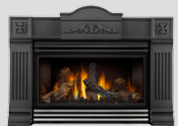
Cast Iron Surround available in black and porcelain enamel Majolica brown