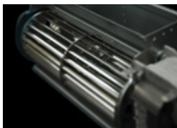
Blower Comes Standard