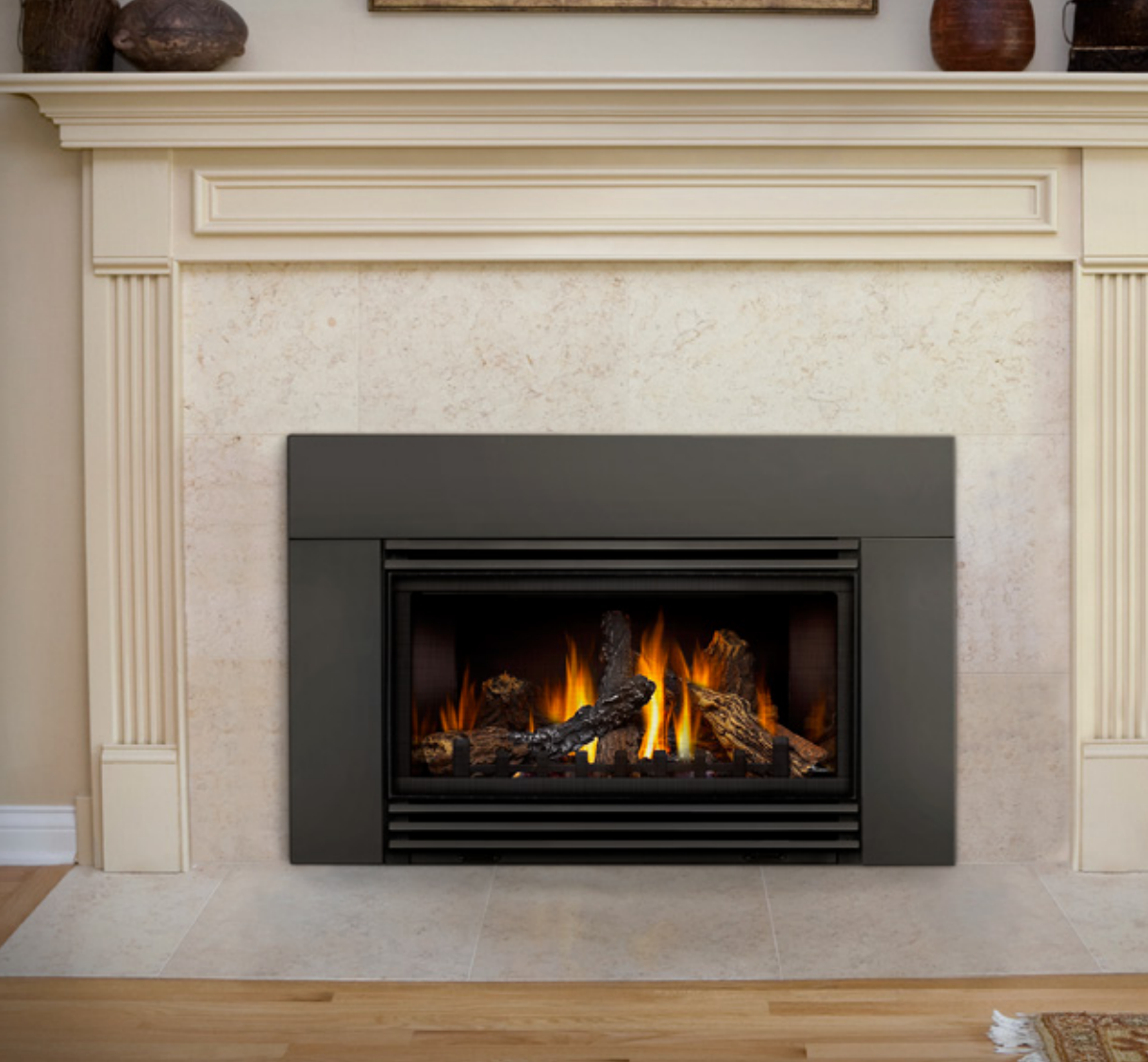
Shown with deluxe 6" flashing kit in painted black, louvers in black and Porcelain Reflective Radiant Panels.