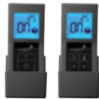
On/Off and Digital Remotes